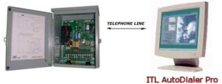
ITL AutoDialer Pro

The MON-830 Enhanced Tower Lighting Monitoring System is available pre-configured and cabled for your specific tower lighting system. The MON-830 works with ITL AutoDialer Pro™ software to provide real time and historical reporting on your tower lighting system.