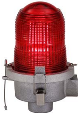
MKR-S750-0DH Single Obstruction Light

The MKR-S750-0DH Single Obstruction Light and MKR-D750-000 Double Obstruction Light have been tested for compliance with applicable FAA specifications for marking hazards to air navigation such as towers, smoke stacks or similar structures. It is intended for installations which require FAA L-810 red lights.