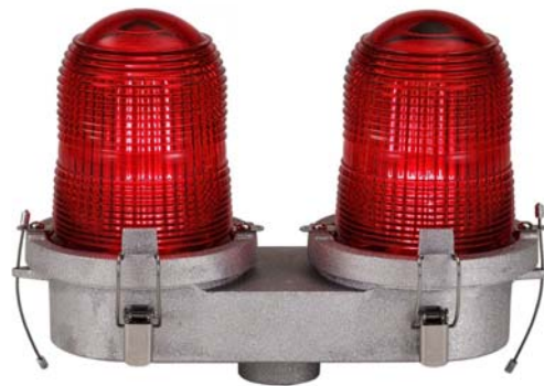
MKR-D750-000 Double Obstruction Light